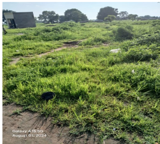
Land purchased for the new Koiyom Residence in Aweil, SS.